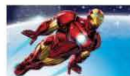
Iron Man (800)