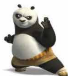
Kung Fu Panda (600)